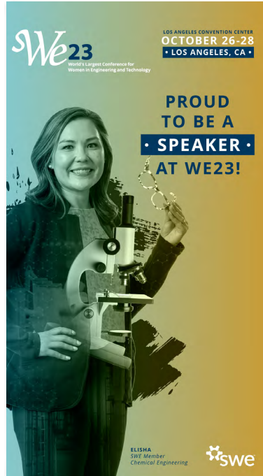
Instagram Story - 1080x1920