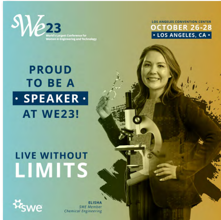
Instagram Post - 1080x1080