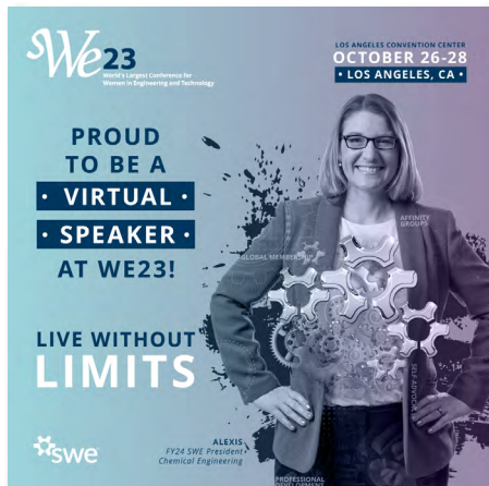
Instagram Post - 1080x1080